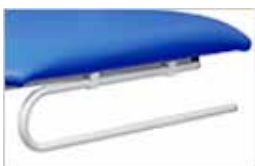
Paper roll holder - included

Order online at meditelle.co.uk or email sales@meditelle.co.uk