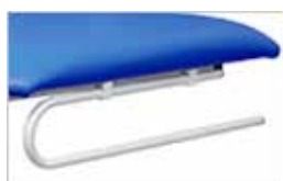
Paper roll holder - included

Order online at meditelle.co.uk or email sales@meditelle.co.uk