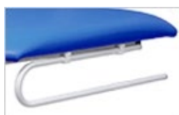
Paper roll holder - included

Order online at meditelle.co.uk or email sales@meditelle.co.uk